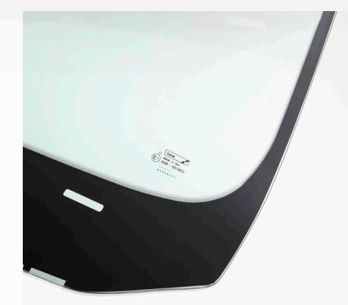
Detail of the front windscreen